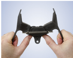
Opening the SnapFast clamp