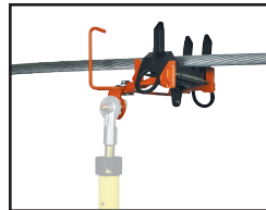
Push to snap closed (tool sold separately)