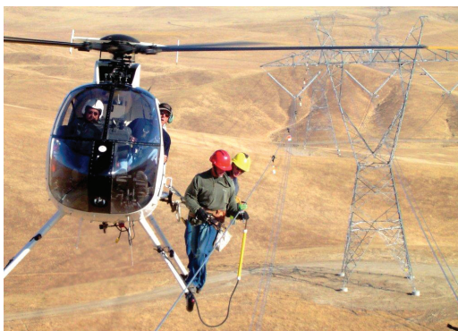
BirdMark can be installed by helicopter

Recommended by the U.S. Fish and Wildlife Service, patented FireFly bird diverters have been shown in independent studies to be the most effective bird diverters in preventing bird strikes on power lines.