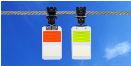
FireFly HW front and back